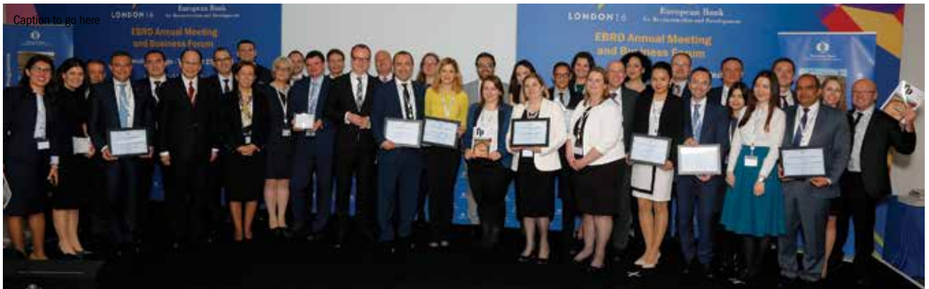
Caption to go here