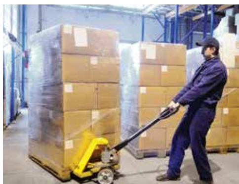
SEPTEMBER 2013 The TFP issues its 15,000th transaction.