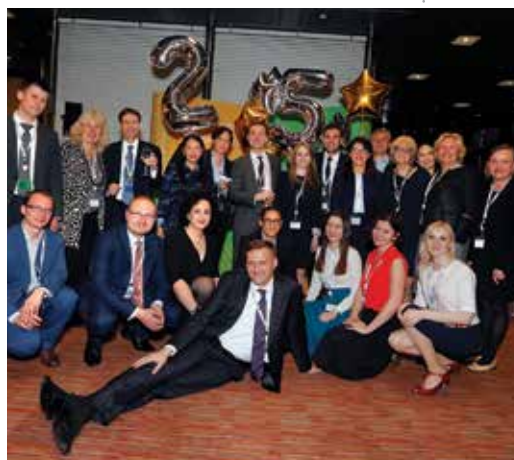
MAY 2016 The TFP celebrates the EBRD's 25th anniversary at the EBRD Annual Meeting and Business Forum in London.