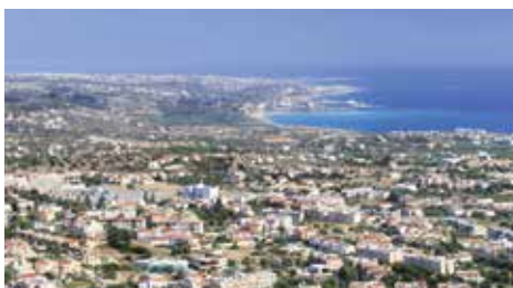
MAY 2014 Cyprus becomes a temporary EBRD recipient country. TFP agreements are signed with Eurobank Cyprus, Bank of Cyprus and Hellenic Bank.