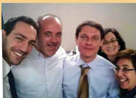
The team from Banca Popolare di Sondrio

The event is a great opportunity for networking