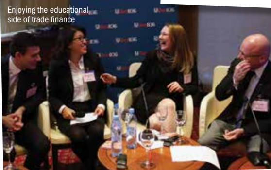
Enjoying the educational side of trade finance