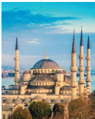
2008 The TFP is extended to include Turkey.