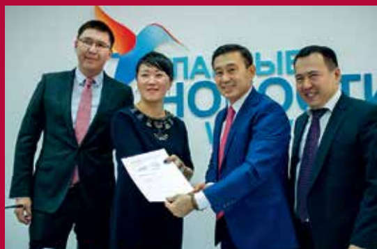
Optima Bank signing in September 2015