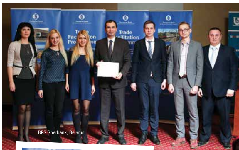
BPS Sberbank, Belarus