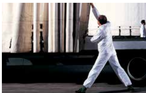
2006 The TFP introduces a new product – factoring.