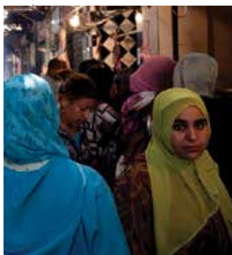
SEPTEMBER 2012 The EBRD extends the TFP to include Egypt, Jordan, Morocco and Tunisia.