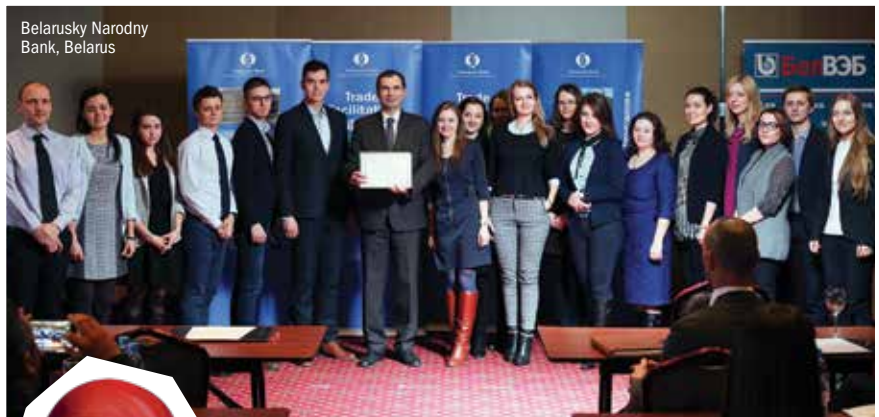
Belarusky Narodny Bank, Belarus