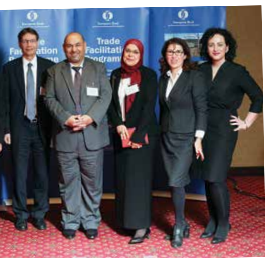
Guests from BCP Morocco, QNB ALAHLI, Egypt and Bank al Etihad, Jordan

“We are proud to support the best graduates with on-the-job internships at Commerzbank. In doing so, not only do we strengthen the knowledge of these bankers, but we also reinforce our relationships with other banks.”