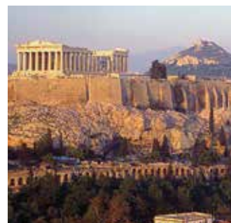
MARCH 2015 Greece becomes a temporary EBRD recipient country. The first issuing bank agreement is signed with National Bank of Greece.